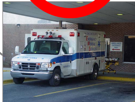
Emergency & Medical