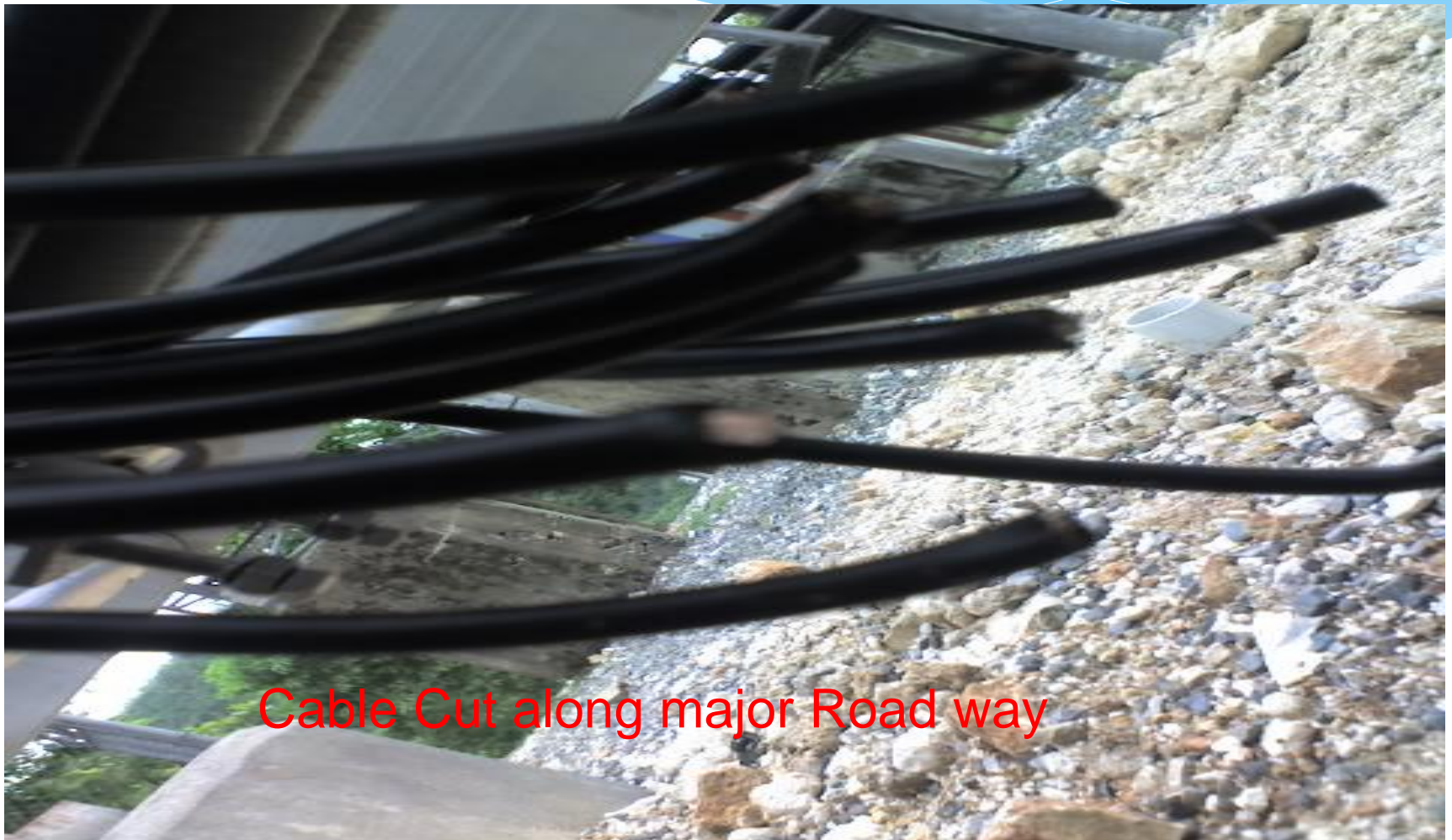
Cable Cut along major Road way