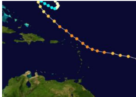
Cat 4 - Hurricane JOSE – Sep 9